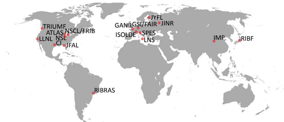
Figure 1. Global census of radioactive ion beam facilities.

envelope or transmutation of neutrons into protons via neutrino capture, enable sequences of proton-capture reactions to proceed at high-temperature. These reactions drive the rapid proton-capture ( rp )-process that largely powers type-I x-ray bursts [11] and classical novae [12] and are a main player in the reaction network leading to nucleosynthesis via the neutrino-p ( \nu p )-process in core-collapse supernovae [13].